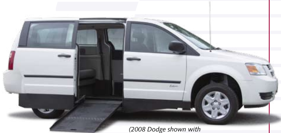
(2008 Dodge shown with commercial-grade steel ground effects)