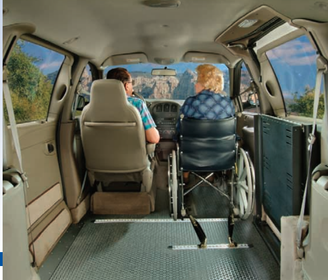
Shown with optional anti-skid flooring and 56" ADA door opening

56" ADA dual seal door opening is available in commercial and personal use vehicles.