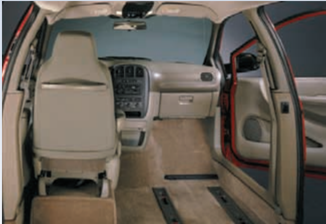
Shown with standard carpeted flooring

Wherever you go...Eclipse makes travel safe and comfortable for everyone.